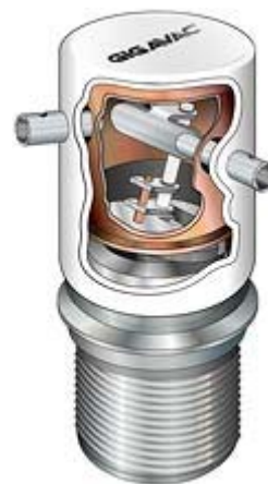
Fig. 2 , GIGAVAC G18 relay. Same as Fig 1, but with built-in shield for power switching