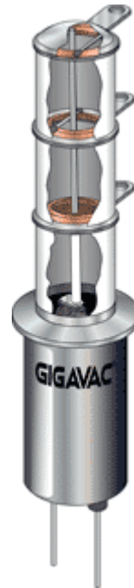
Fig. 4 , GIGAVAC Diaphragm Style, Double Throw relay design