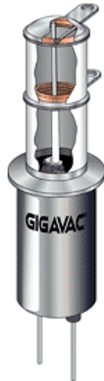
Fig. 3 , GIGAVAC Diaphragm Style, Single Throw relay design

Figure 4 is a double throw relay. The normally open contact is at the top, the normally closed contact is in the center, and the moving contact is at the bottom. For this relay, the sealed chamber extends from the top of the relay down to the diaphragm that is the moving contact. Both the normally open and normally closed contacts are in the same sealed chamber.