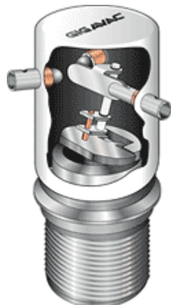
Fig. 1 , GIGAVAC Internal Armature style, Double Throw relay design

When power is applied to the coil of these relays, a magnetic field is transferred through a pole that runs through the center of the coil to the armature, that is located inside the sealed switching chamber. The armature moves the common contact to the normally open contacts. A spring inside the sealed chamber returns the moving contact to the normally closed contact when coil voltage is removed.